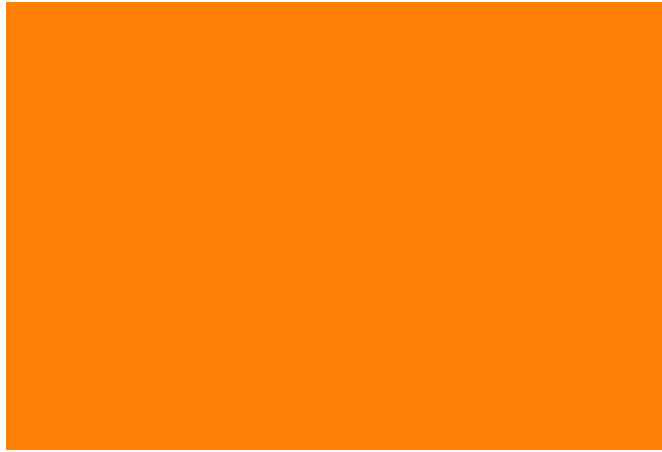
Table 2. Average scores of 15-year-olds in mathematics in the PISA